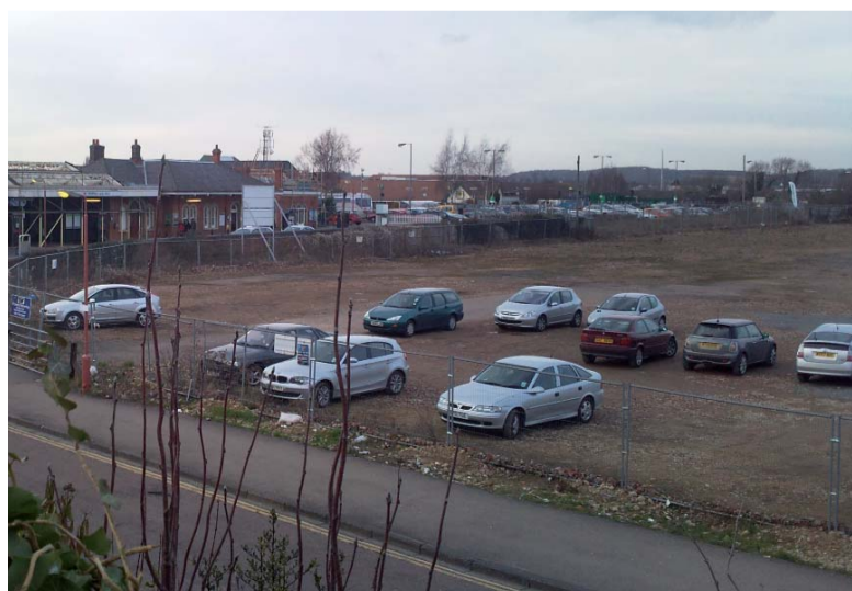
Photo of entrance to Stratford-upon-Avon railway station in its current condition

There will also be a "kiss-and-drop" zone so that rail users can be dropped off immediately outside the railway station entrance.